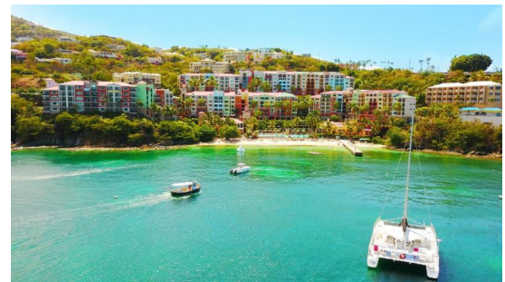
Marriott's Frenchman's Cove

The AACCAA's Board of Directors is sponsoring a raffle to raise money for programs that support Anne Arundel County residents living in poverty.