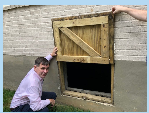
WX staff members examine the crawl space of a clients home during the assessment

Weatherization Programs Administered by the Community Action Council of Howard County Help People on All Walks of Life