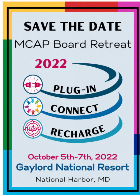
Board Meeting Basics